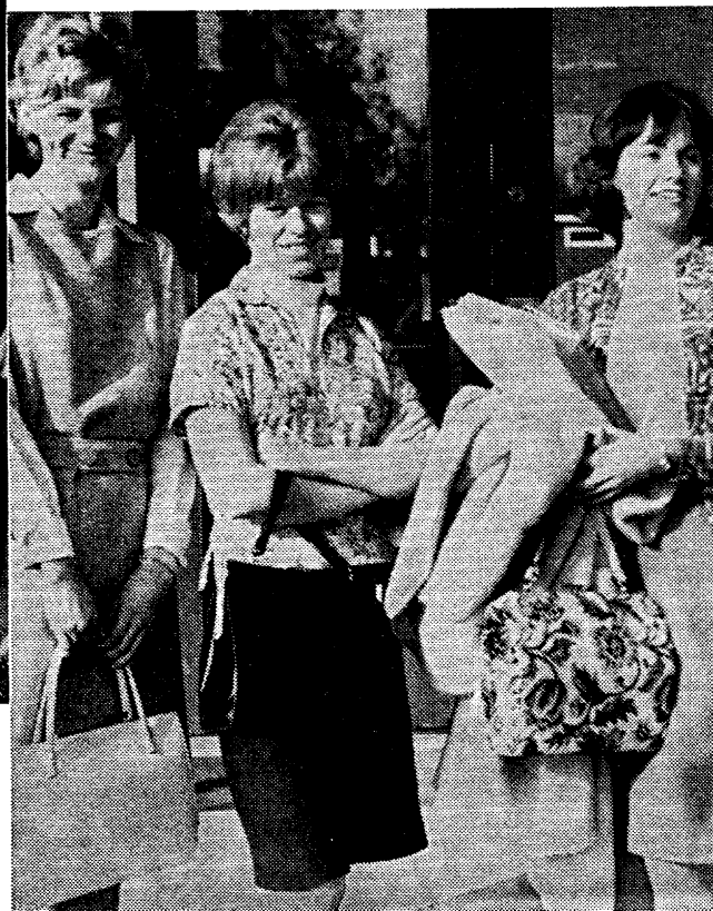
Class B winners: